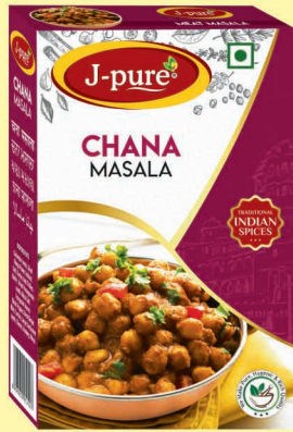
CHANA MASALA 15GM/50GM/100GM