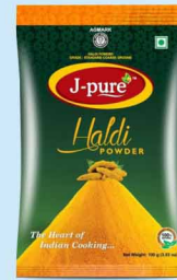
HALDI POWDER 100GM/200GM/500GM/1KG