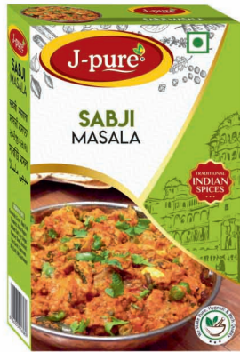
SABJI MASALA 100GM