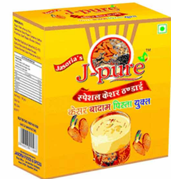
KESARI THANDAI 160GM/400GM/800GM