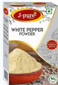
WHITE PEPPER POWDER 15GM/100GM