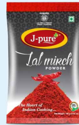
MIRCH POWDER 100GM/200GM/500GM/1KG