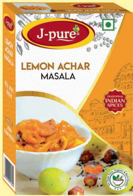
LEMON ACHAR MASALA 200GM