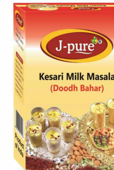
KESARI MILK MASALA 50GM/100GM