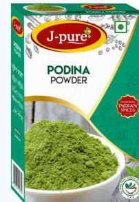
PODINA POWDER 100GM