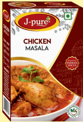
CHICKEN MASALA 100GM