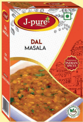
DAL MASALA 100GM