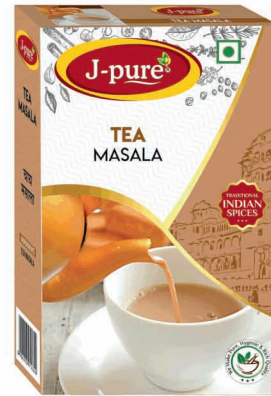
TEA MASALA 50GM