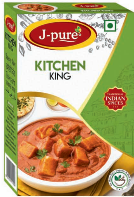
KITCHEN KING 15GM/100GM