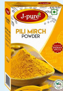
PILLI MIRCH POWDER 100GM