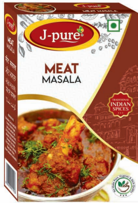
MEAT MASALA 15GM/50GM/100GM