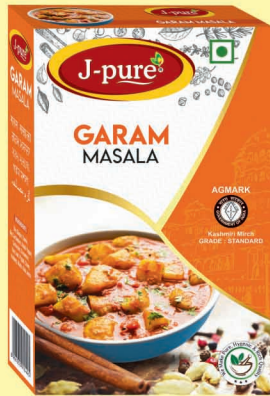
GARAM MASALA 15GM/50GM/100GM