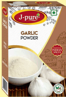
GARLIC POWDER 100GM