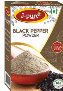
BLACK PEPPER POWDER 15GM/50GM/100GM