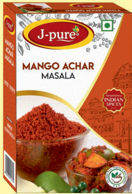
MANGO ACHAR MASALA 200GM

Our range of Veg Spices Group is specially manufactured to bring additional taste to the special dishes like Pani Puri, Pao Bhaji, Raita, Sambhar, etc. These ranges of spices bring the right aroma and color to your favorite dishes.