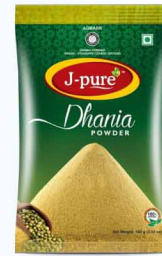
DHANIYA POWDER 100GM/200GM/500GM/1KG