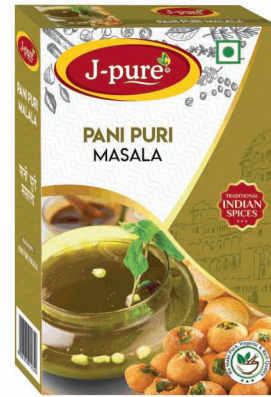
PANI PURI MASALA 100GM