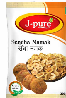
SENDHA NAMAK 100GM/200GM/500GM/1KG