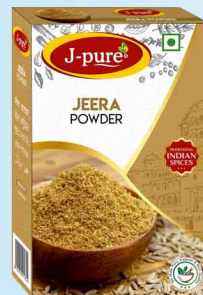
JEERA POWDER 100GM