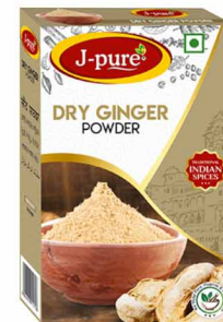
DRY GINGER POWDER 100GM