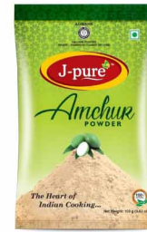
AMCHUR POWDER 100GM/200GM/500GM/1KG