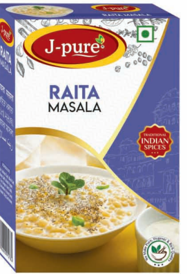
RAITA MASALA 100GM