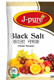
KALA NAMAK 100GM/200GM/500GM/1KG