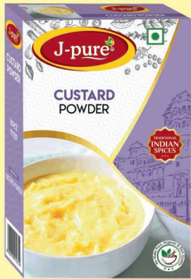
CUSTARD POWDER 100GM