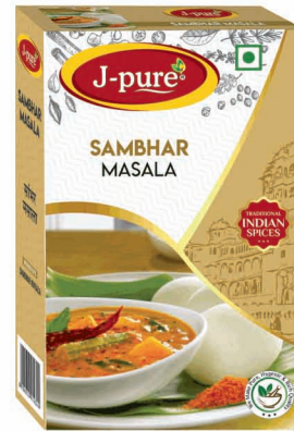
SAMBHAR MASALA 15GM/50GM/100GM