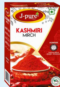
KASHMIRI MIRCH 100GM