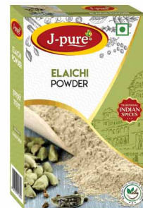
ELAICHI POWDER 15GM/50GM/100GM