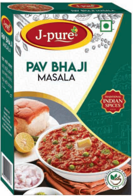
PAV BHAJI MASALA 15GM/50GM/100GM