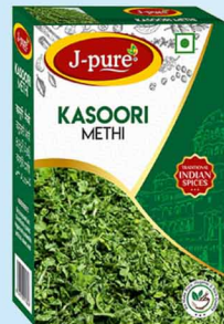
KASOORI MAITHI 25GM/50GM/200GM/500GM