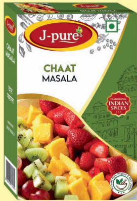
CHAT MASALA 15GM/50GM/100GM